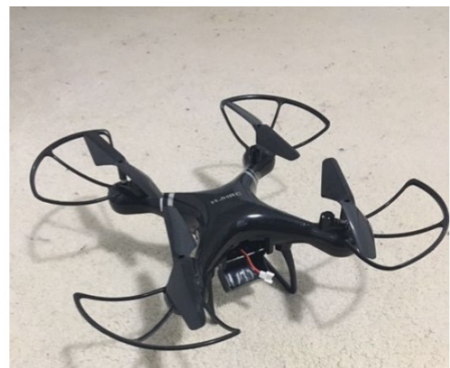
Drone I'm using for manual research.jpg