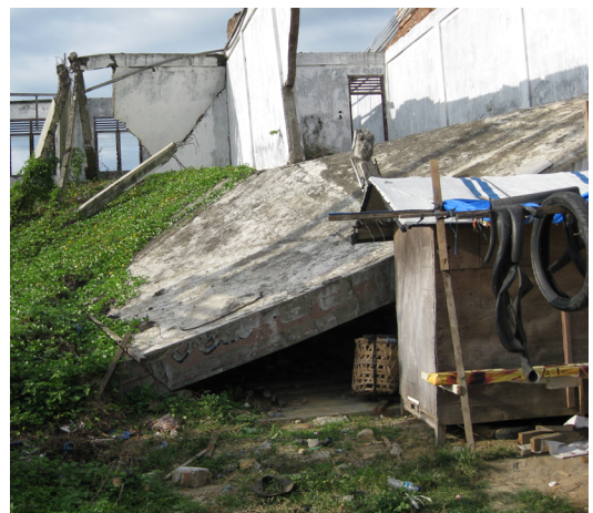
A collapsed building in Banda Aceh

Liam gained Chartered Engineer status in January 2011.