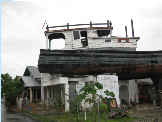
Boat on a roof in Banda Aceh a memorial to victims of the Tsunami

Following this he moved to Australia where he worked in Tasmania for 2 years in a structural timber engineering role and gained Australian citizenship. He is currently working for GHD Pty Ltd a large multi-national engineering firm, in Canberra where he has been for the past 3 years.