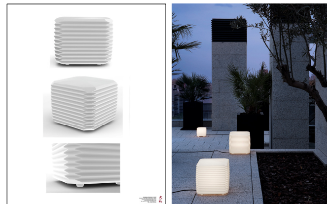
Carpyen ZigZag by Daifuku Designs (Left) CAD Model (Right) Final Product