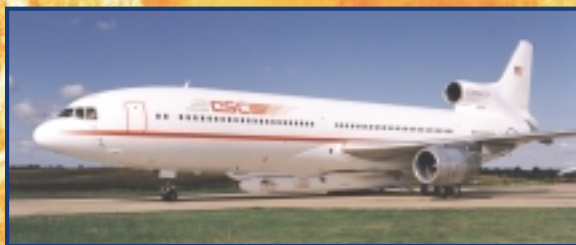
The Marshall modified L10-11 TriStar carrying the Pegasus Satellite Launch Rocket.